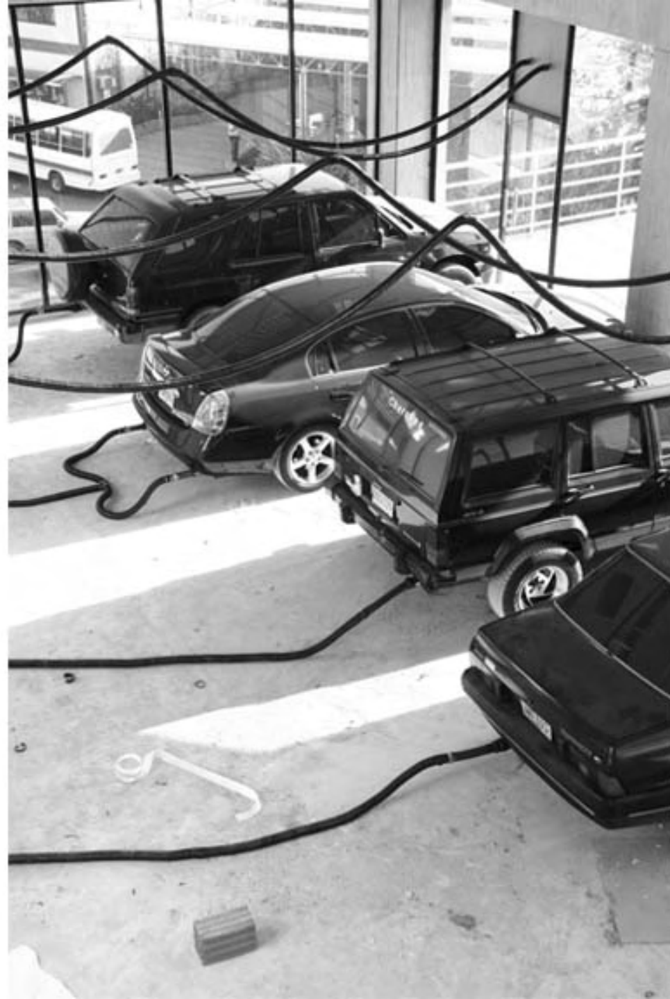
Santiago Sierra - Four black vehicles with the engine running inside an Art Gallery. Photo Sala Mendoza, Caracas, Venezuela, February 2007 Image taken from https://www.widew alls.ch/